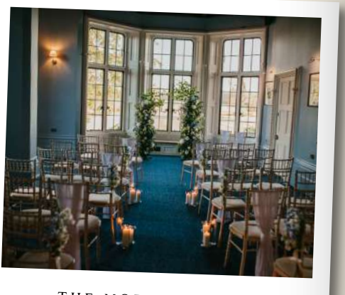
THE MORNING ROOM